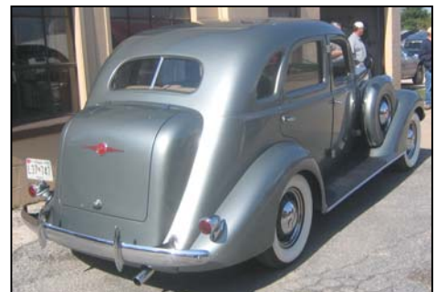
Humpback sedan styling of the era