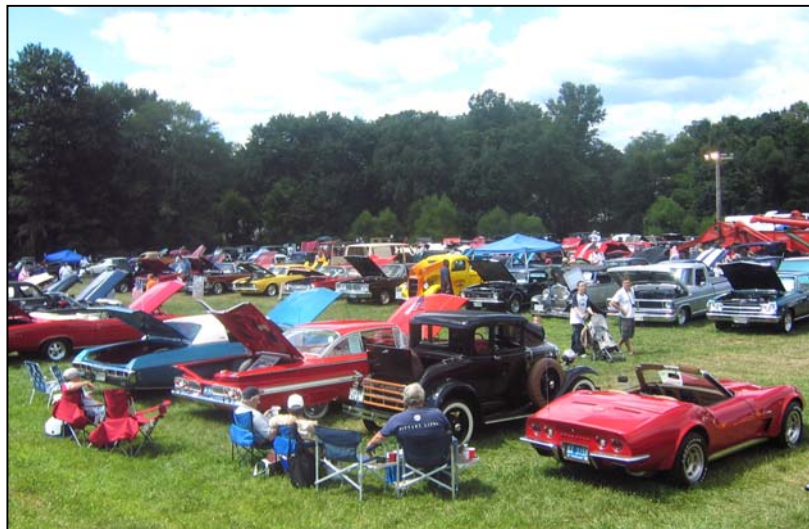
View of part of the show field with attendees listening to the DJ music.

a lot of fun just walking around the show field and looking at the variety of vehicles.