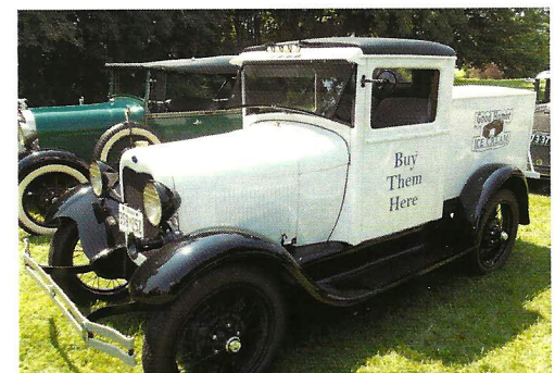
Fred Hyer's faithfully restored 1931 Ford Truck. Geez, I can almost taste a 'roasted almond bar'!