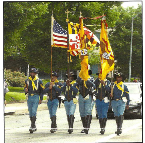
Members of the 9th and 10th Regiment of 'The Famous Buffalo Soldiers' march again in the July 4, 2014 Towson Parade

The Ravens Marching Band and many other interesting attractions kept the attendees anticipating the next unit coming down the street. There were also many costumed characters like the Oriole Bird, 'Smokey Bear', 'Bullwinkle J. Moose'; Bullwinkle's buddy, 'Rocky the Flying Squirrel' apparently couldn't get flight clearance from BWI/Marshall airport for the parade and was a no show. A crowd favorite was the snappy performing marching unit composed of Scottish bagpipers and drummers, men and women, in full regalia. For many years, Chesapeake Region has been invited to parade their antique cars. Continued on page 2