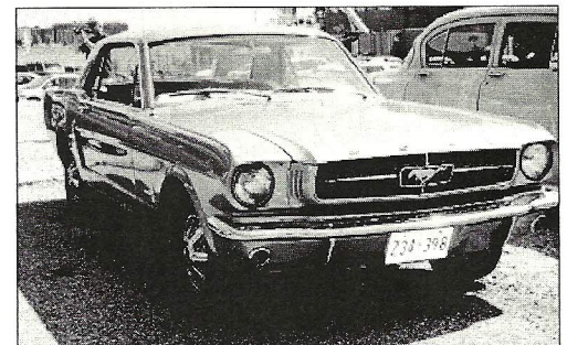
Gary Ruby's 'super nice' 1965 Ford Mustang