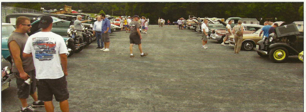
Above, a view of many of the vehicles on display in the 2014 Howard County Fair and Car Show, August 3rd. Twenty-Eight cars were in the 'antique' group and 13 cars in the 'modified' group. Heavy rain overnight and early morning curtailed the number of participants.