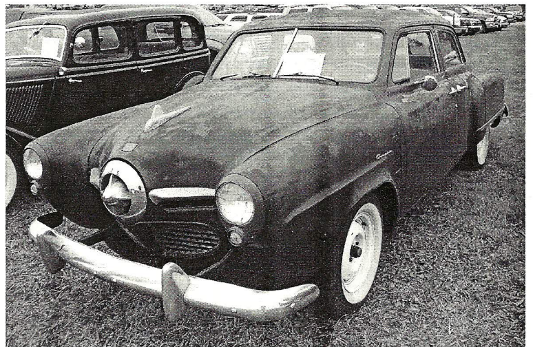
I failed to take a picture of the windshield card for identification. I think it's a 1950 Studebaker Champion. It's a sedan with 'center' opening doors.

I held out as long as I could but I'm a sucker for funnel cake and the local Kiwanis Club has the market cornered at The Arcadia, Steam Show; it's the best I've ever had.