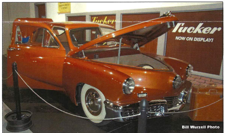
One of three Tucker '48' models on display at the A.A.C.A. Museum. The model designation 'Torpedo' was dropped for production vehicles because Preston Tucker didn't want to remind people of World War II.

Preston Tucker was a visionary even if he was occasionally a loose cannon. I'm disappointed another automobile manufacturer didn't buy his dream and bring it to market or a least some of his ideas. Mr. Tucker died from lung cancer December 26, 1956, he was only 53 years old.