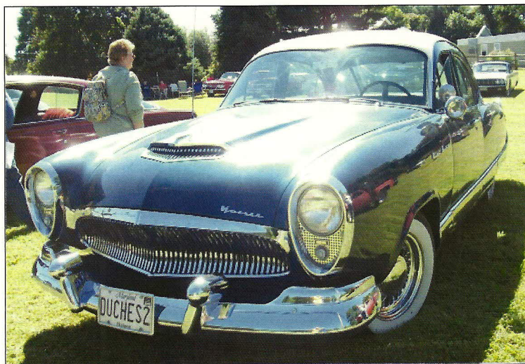
The 1954 Kaiser Manhattan is a very attractive automobile from every angle. The color-keyed interiors were a first in the industry.