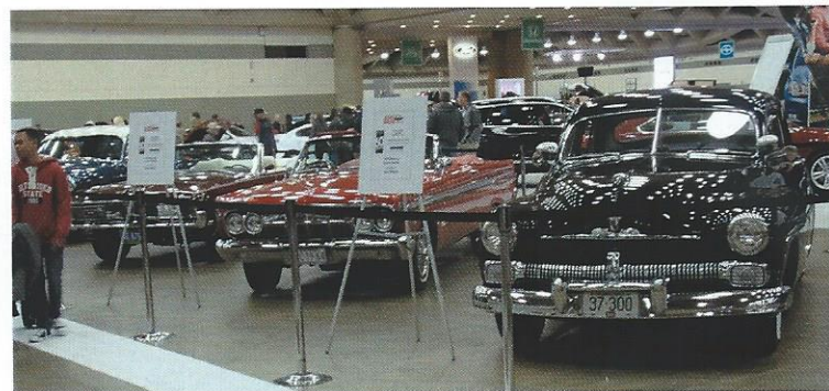
Display looking West