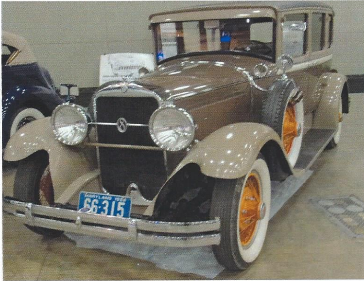
Pat Wenderoth's 1928 Studebaker Eight Sedan