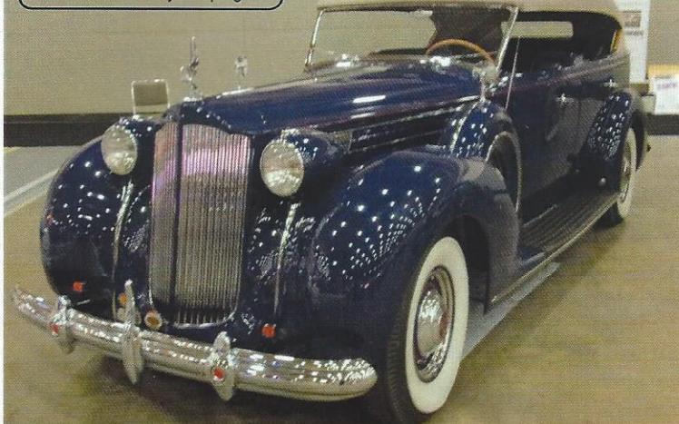
Many spectators 'gushed' over the vehicles Chesapeake Region had on display. However, all would agree the most spectacular vehicle was the 1938 Packard '12', 1608 Phaeton Convertible with aluminum body by Derham.