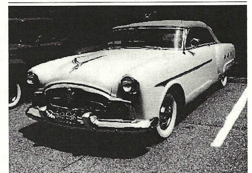
Spotted at the crab feast on July 19; to whom does this gorgeous 1952 Packard Convertible belong?

Afterward we met up with family for another July 4th tradition, a picnic at my brothers' house in Towson.