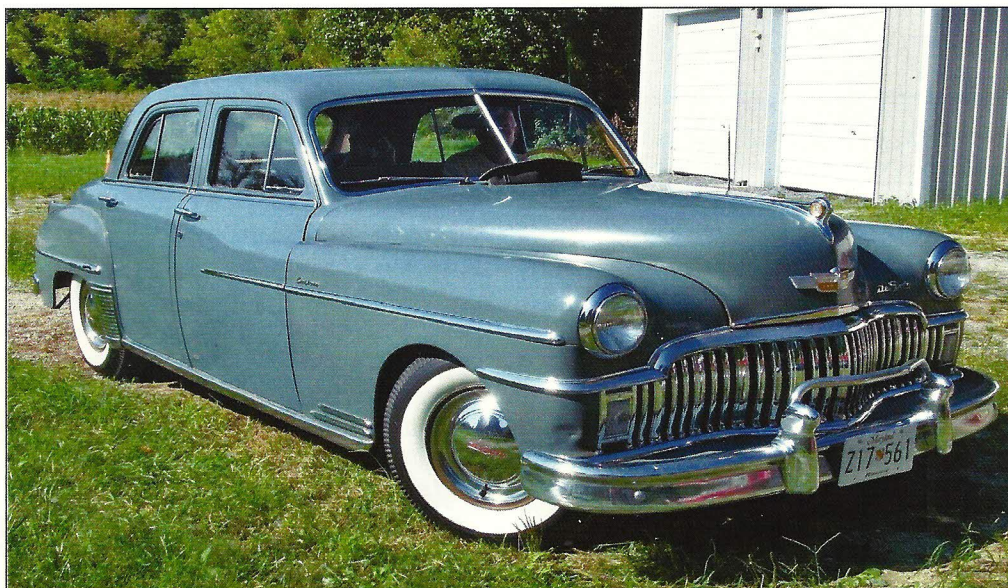
August 2014, from gritty, grimy and forlorn hulk to the above with knowledge, dedication and tender loving care.