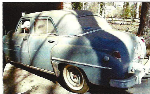
February 2014, emerging into sunlight after 40 years!