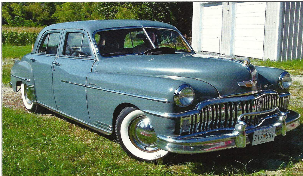
August 2014, from gritty, grimy and forlorn hulk to the above with knowledge, dedication and tender loving care.