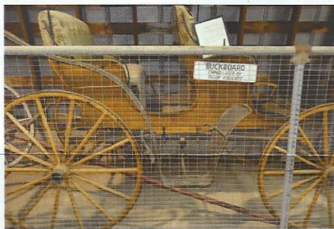
Buckboard owned and used by President Teddy Roosevelt, Space Farms Museum & Zoo, Sussex, NJ.

Miss America has wrestled with a tottering tiara atop her expression of disbelief, was a highlight of the day. The Hall houses the largest and loudest pipe organ ever constructed. It is also the largest musical instrument ever created. It has thirty-three thousand pipes, however, due to the devastation of a hurricane many decades ago, it now functions at only twenty percent capacity. Still, it is thunderous. The cavernous auditorium was empty that day, except for the one hundred fifty or so Founders Tourists who appeared almost lost in one tiny segment of seats. We were treated to a sampling of lovely music played on that mighty organ by the resident organist. His final selection was "The Star Spangled Banner." Believe me when I tell you that my heart leapt up when I saw that all of our group had risen to their feet, and with hats removed and hands on