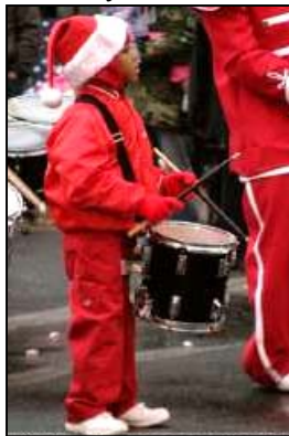
Little Drummer Boy