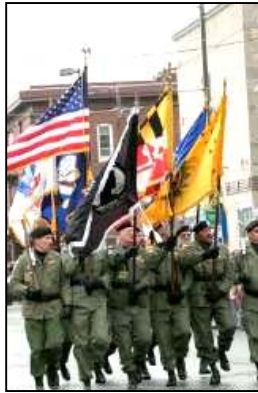
Military Color Guard