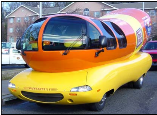
This hot dog needed some mustard