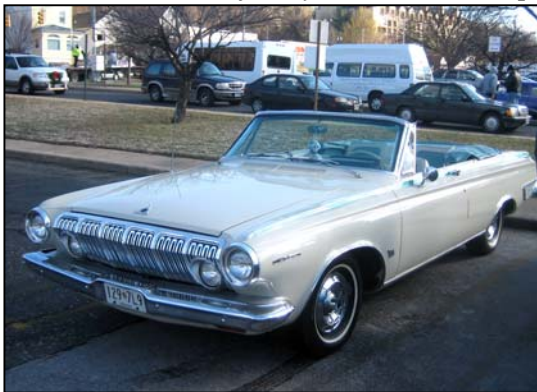
Chris Cassell's 1963 Dodge