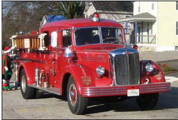
Fire Museum of Maryland's 1949 Mack pumper