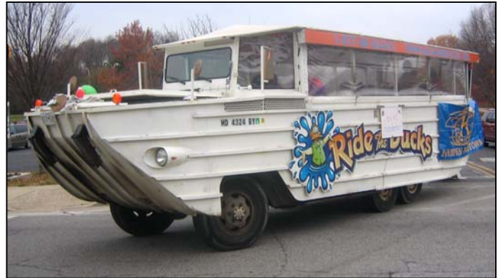
A Duck tourmobile makes a warm parade ride